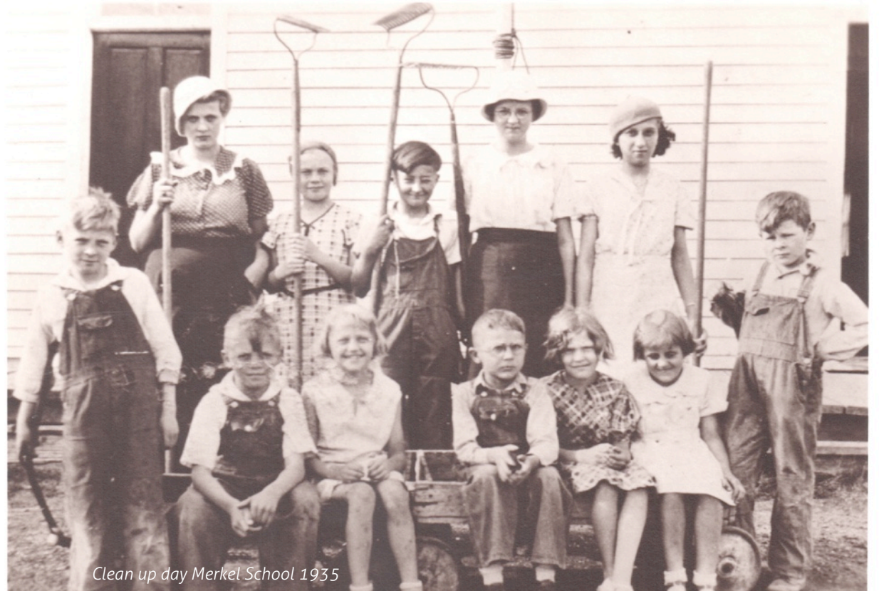
Clean up day Merkel School 1935

October 11-12, 2019 Recycling Memories While Building for the Future