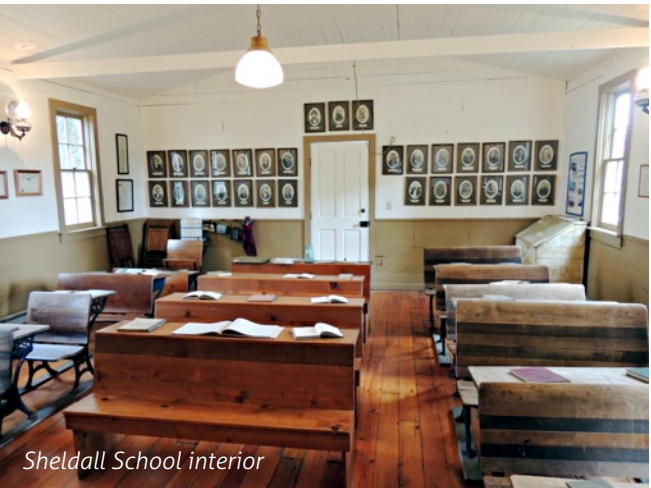
Sheldall School interior

SPECIAL THANKS TO: Ames Historical Society Story City Greater Chamber Connection Story Theatre Brochure designed by Rachel Faga Designs